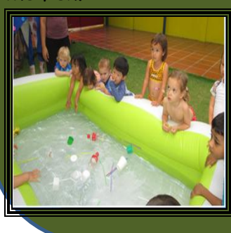
All the children cleaned the pool before they went swimming with the fish